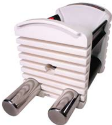
Image on bottom right shows two different types of SportBlock® weight plates. The 1/4" thick weight plates (Sport 5.0 and 5.5) weigh 5 lbs each. The 1/2" thick weight plates (Sport 9.0) weigh 10 lbs each.

Image on right shows variable weight handle in the open position with the two adder weights partially out of handle. The adder weights are included at no additional charge with variable weight handles.