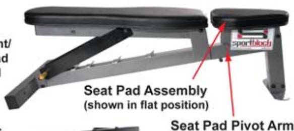
Seat Pad Pivot Arm