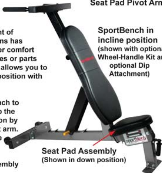
Seat Pad Assembly (Shown in down position)